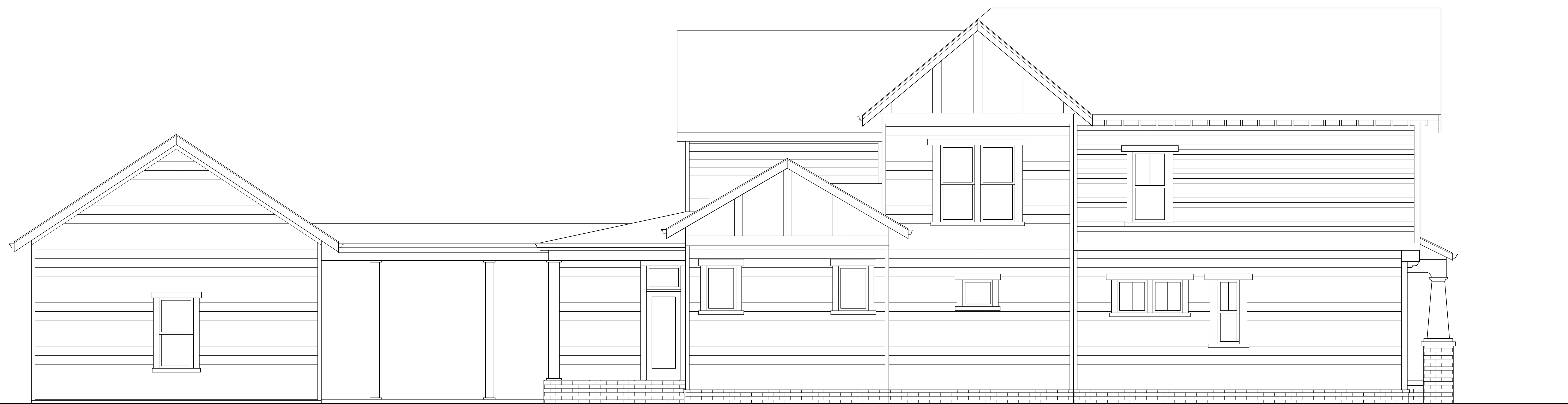
1 LEFT SIDE ELEVATION 1/8" = 1'-0"

MILLER SMITH DESIGN millersmithdesign.com matt@millersmithdesign.com | 615.870.8851