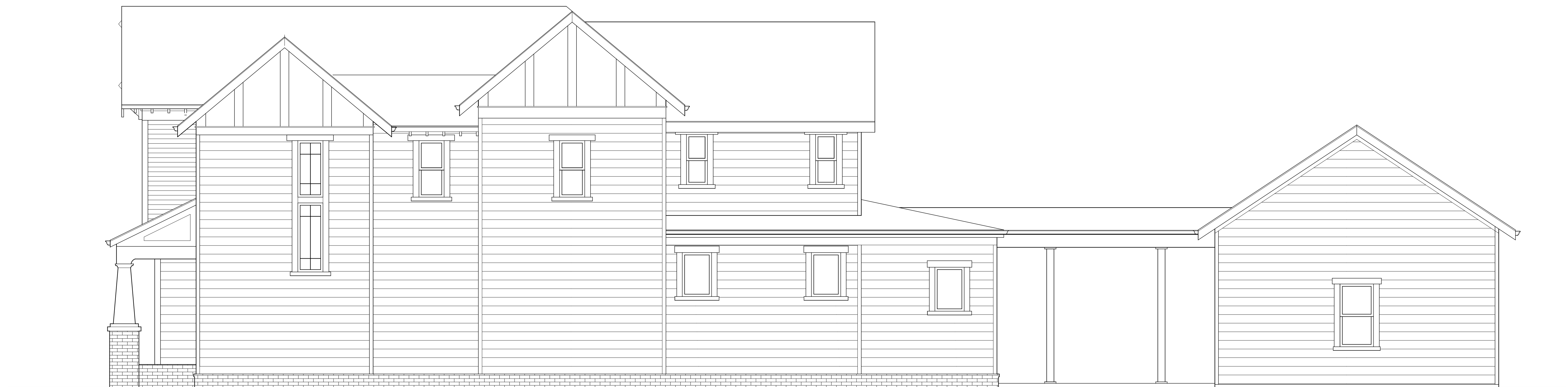
2 RIGHT SIDE ELEVATION 1/8" = 1'-0"

MILLER SMITH DESIGN millersmithdesign.com matt@millersmithdesign.com | 615.870.8851