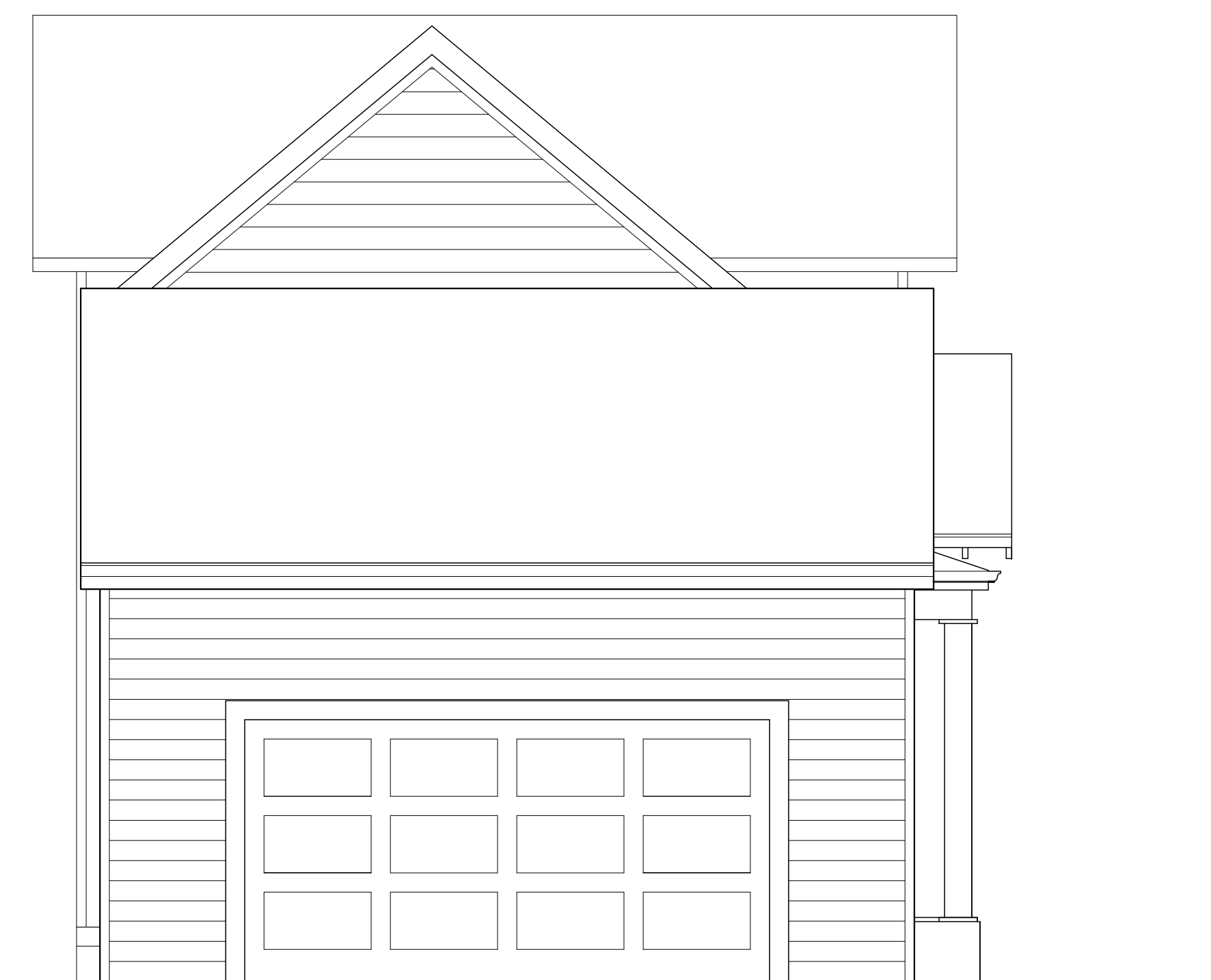
1 FRONT ELEVATION 1/8" = 1'-0"