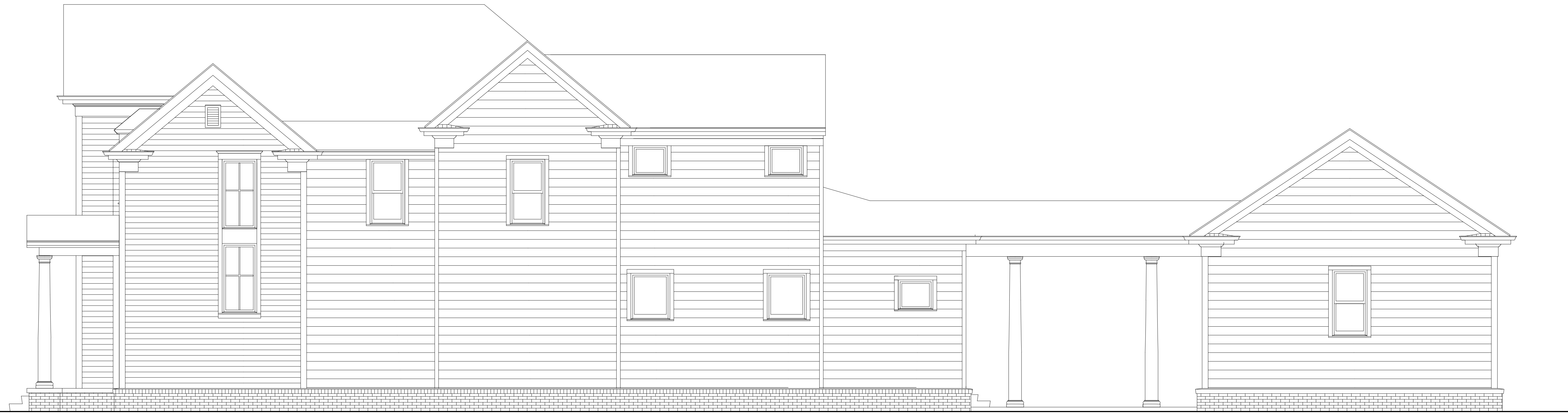
2 RIGHT SIDE ELEVATION 1/8" = 1'-0"

MILLER SMITH DESIGN millersmithdesign.com matt@millersmithdesign.com | 615.870.8851