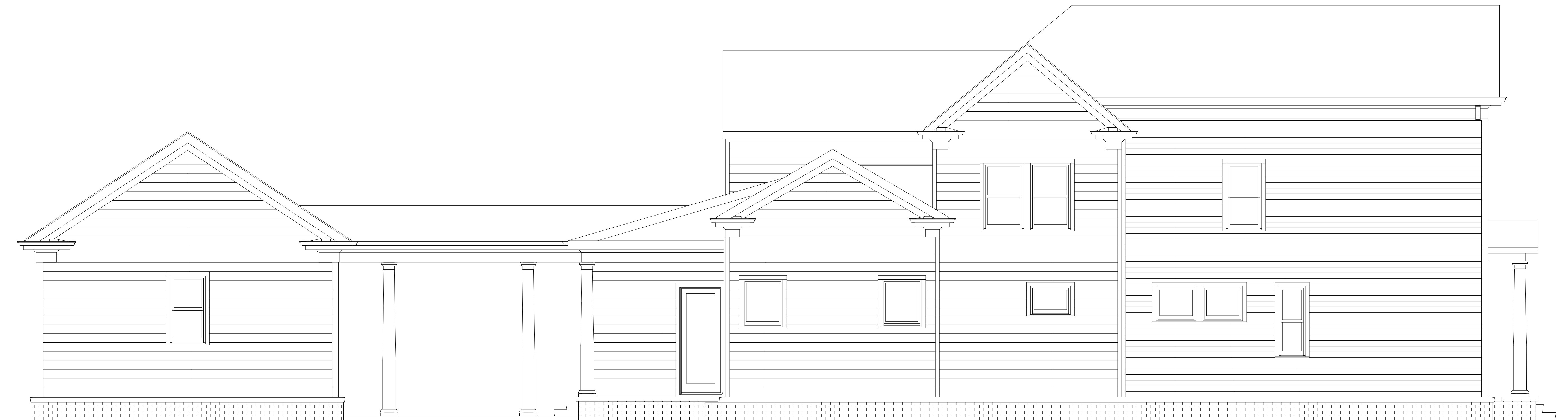
1 LEFT SIDE ELEVATION 1/8" = 1'-0"

MILLER SMITH DESIGN millersmithdesign.com matt@millersmithdesign.com | 615.870.8851