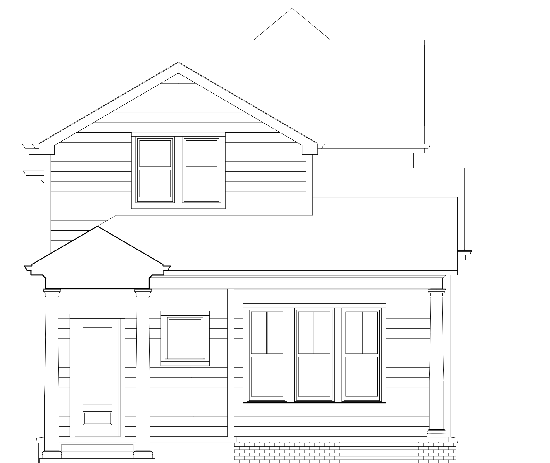
2 REAR ELEVATION 1/8" = 1'-0"