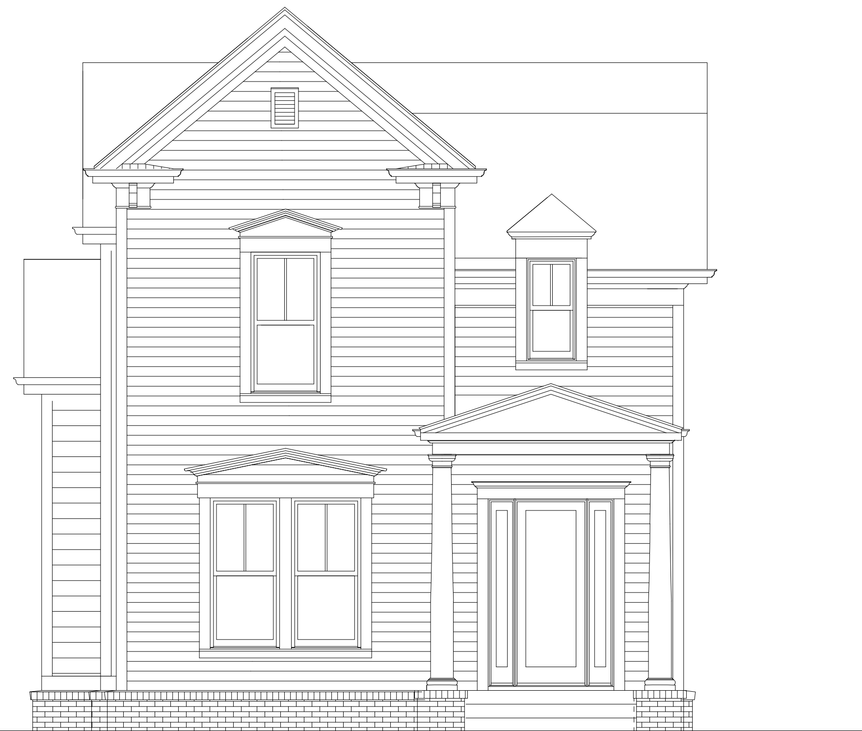
1 FRONT ELEVATION 1/8" = 1'-0"