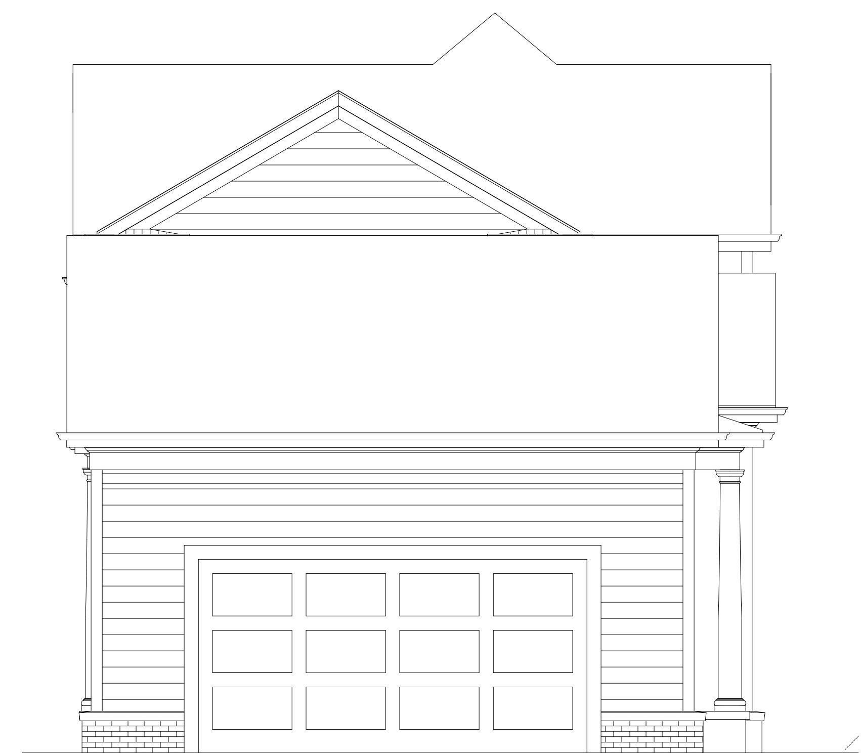
3 REAR ELEVATION - ALLEY 1/8" = 1'-0"

MILLER SMITH DESIGN millersmithdesign.com matt@millersmithdesign.com | 615.870.8851