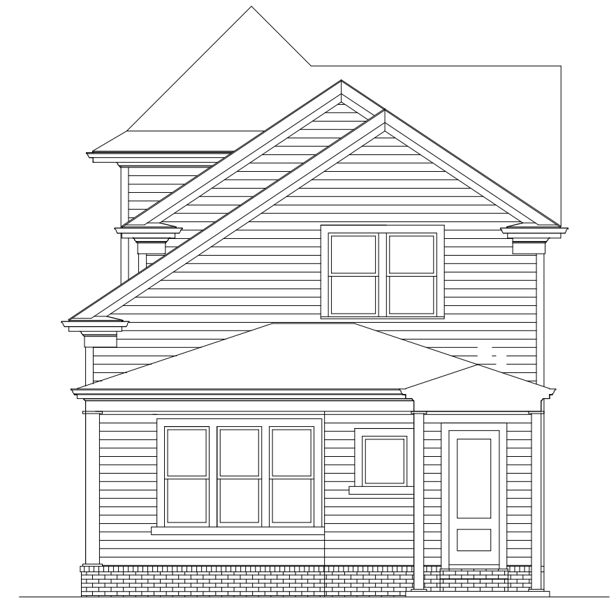
AUX. REAR ELEVATION