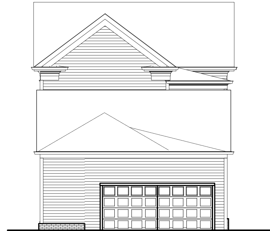
2 REAR ELEVATION 1/8" = 1'-0"

MILLER SMITH DESIGN millersmithdesign.com matt@millersmithdesign.com | 615.870.8851