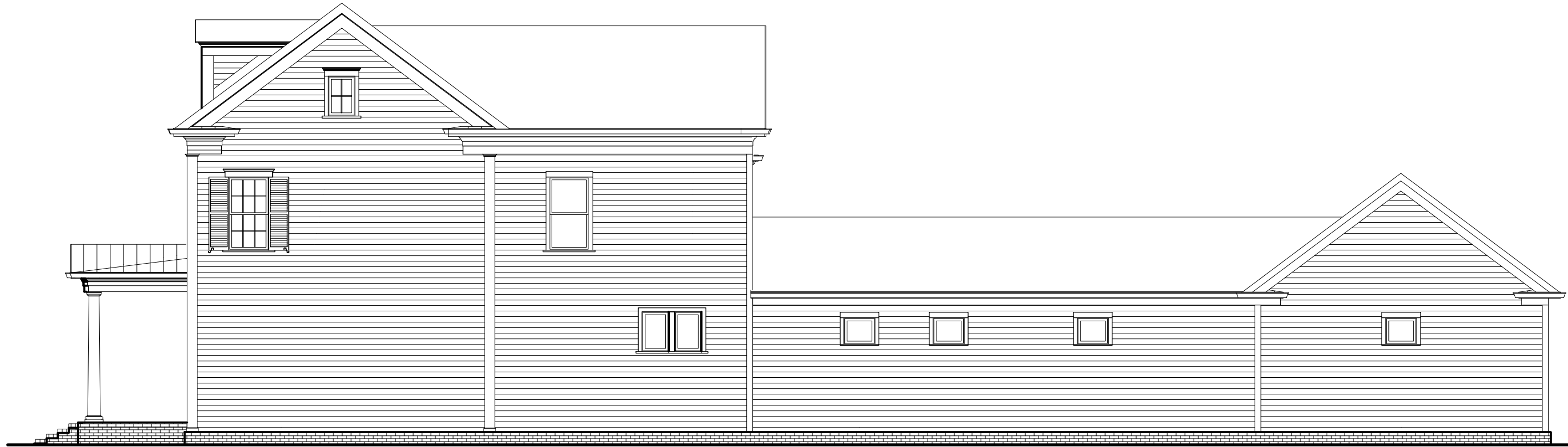
1 RIGHT SIDE ELEVATION 1/8" = 1'-0"

MILLER SMITH DESIGN millersmithdesign.com matt@millersmithdesign.com | 615.870.8851