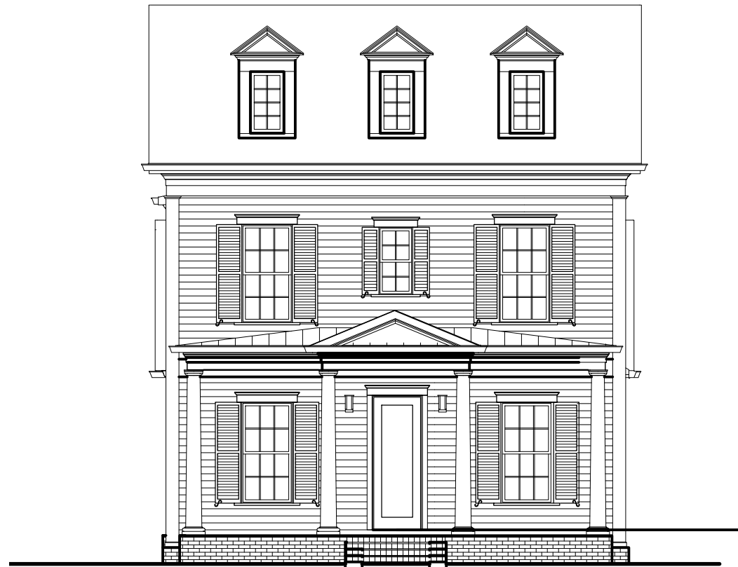
1 FRONT ELEVATION 1/8" = 1'-0"