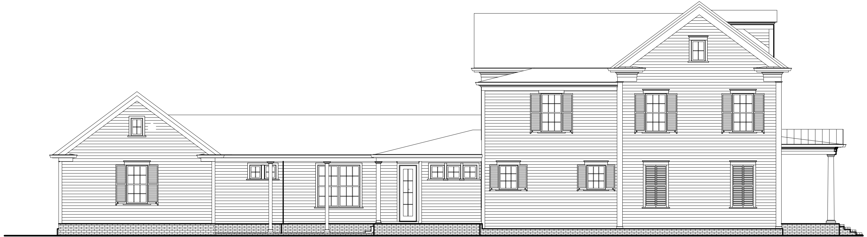
1 SIDE ELEVATION 1/8" = 1'-0"

MILLER SMITH DESIGN millersmithdesign.com matt@millersmithdesign.com | 615.870.8851