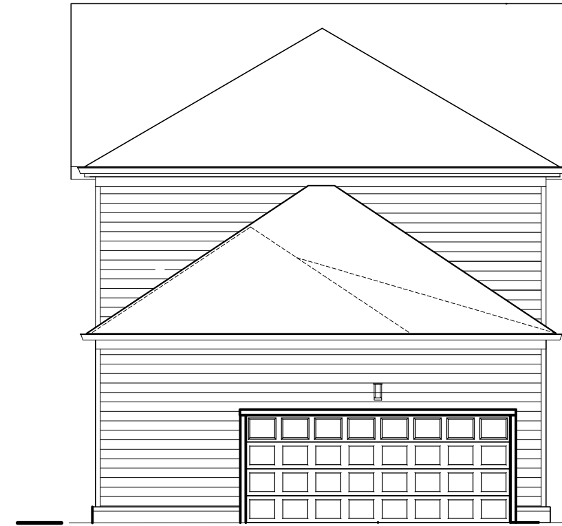
2 REAR ELEVATION 1/8" = 1'-0"

FOUR SQUARE DESIGN STUDIO 620 8TH AVENUE SOUTH NASHVILLE, TN 37203 615-431-3664 WWW.4SQUARE.DESIGN