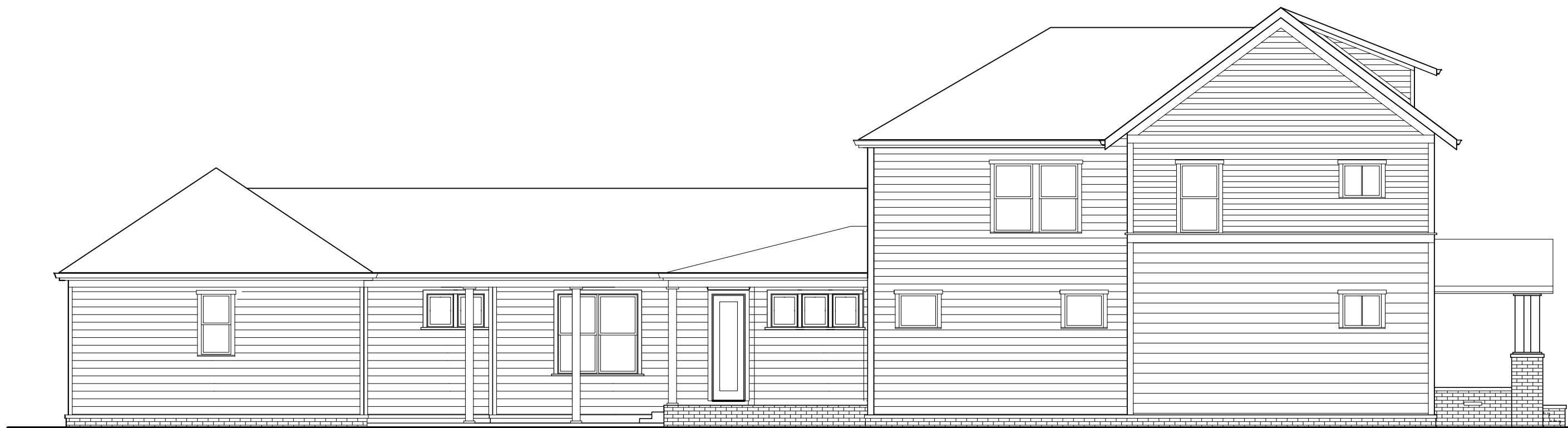
1 LEFT SIDE ELEVATION 1/8" = 1'-0"

FOUR SQUARE DESIGN STUDIO 620 8TH AVENUE SOUTH NASHVILLE, TN 37203 615-431-3664 WWW.4SQUARE.DESIGN